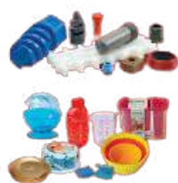
INJECTION MOULDING PRODUCTS