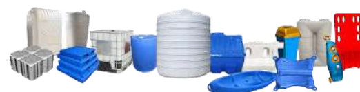
BLOWN MOULDING PRODUCTS